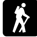
Table Rock Feather River Ranger District